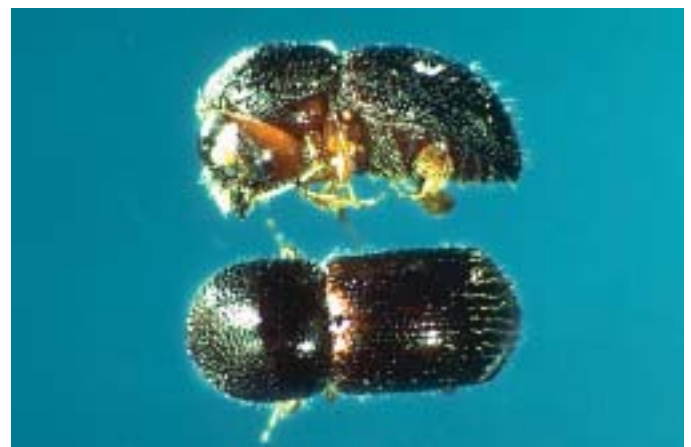
Ambrosia bark beetle adults. (2)